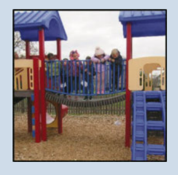
Register for the 2024-25 school year!